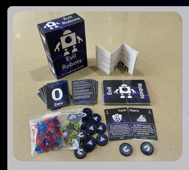
Components: 53 Cards (10 Power, 9 Guides, 34 Robots) 18 Poker Chips (double-sided) 20 Action Tokens 50 Score Tokens or 9 Dials Rulesheet

Evil Robots is a hidden-roles game for 3-9 humans pretending to be robots debating the future of humanity. Negotiate, bluff, and use your robot powers to get yourself on the winning team for a share of the points.